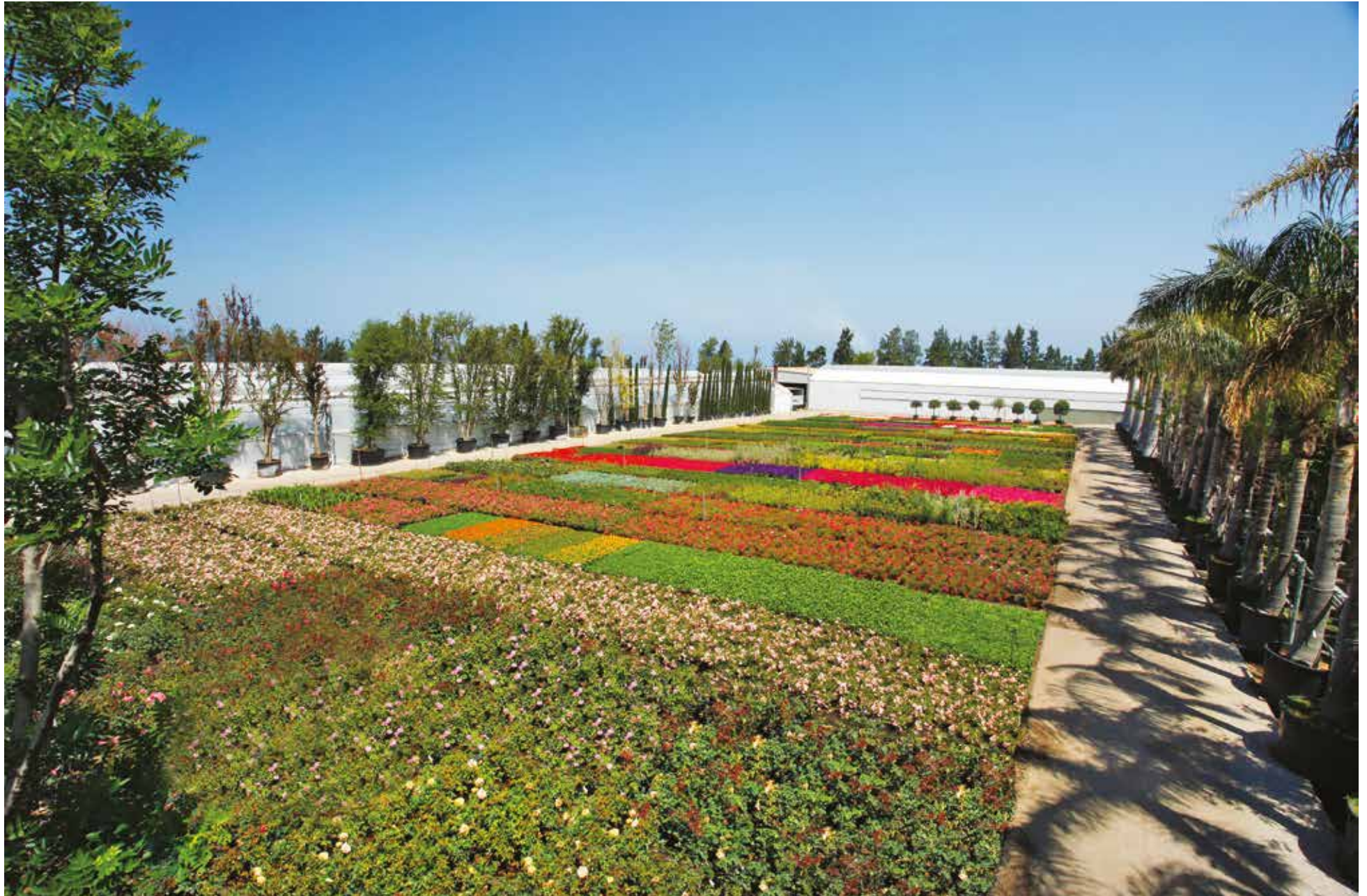
Exotica Nursery - Zouk Mosbeh, Lebanon