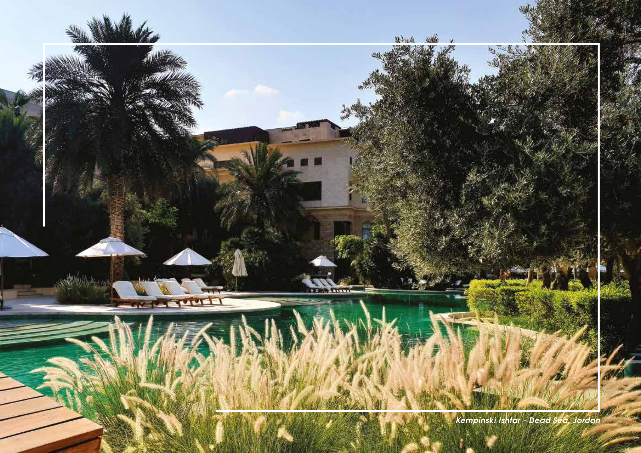
Kempinski Ishtar - Dead Sea, Jordan