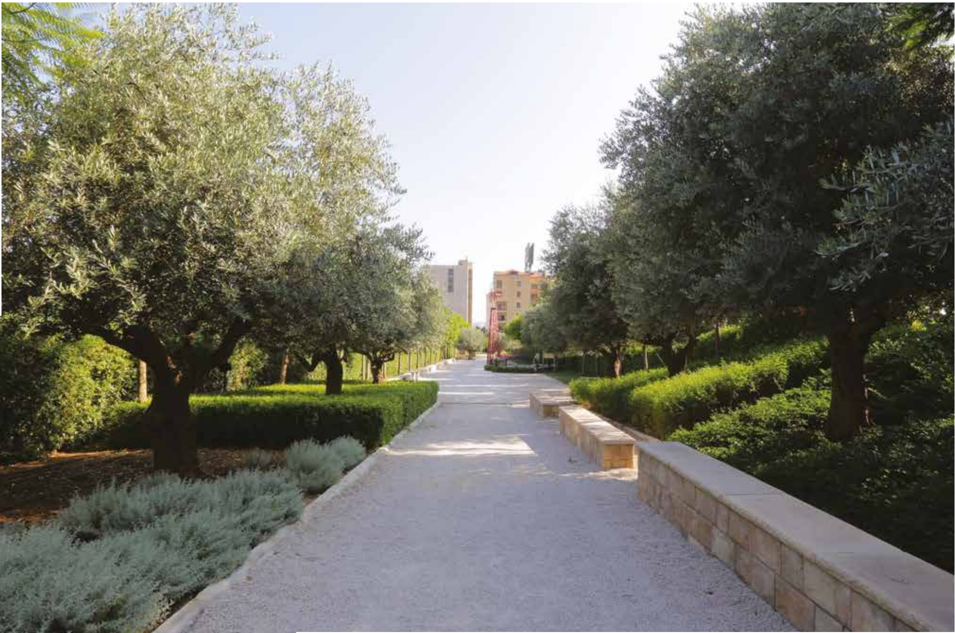
Jounieh Zone Verte - Jounieh, Lebanon