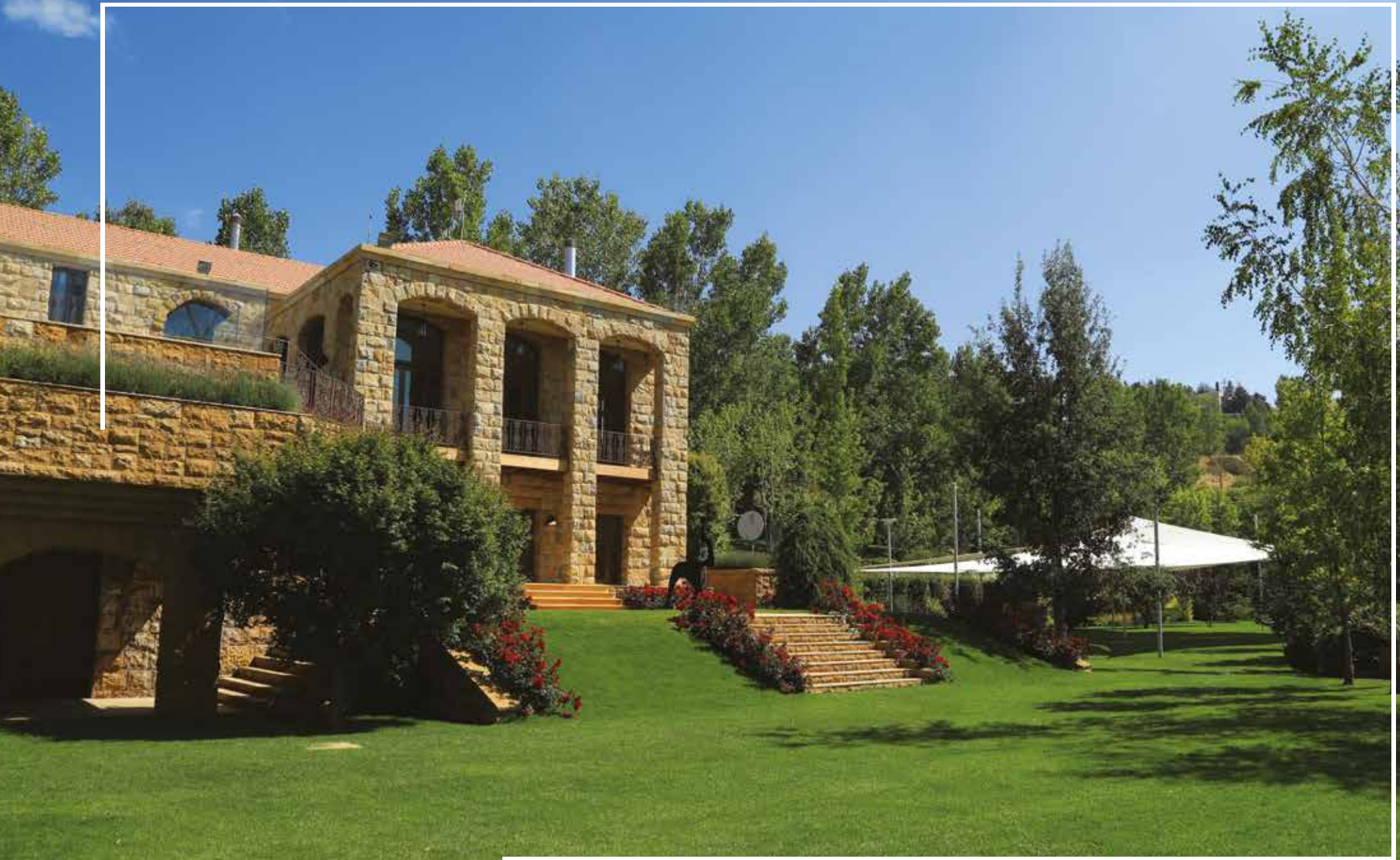
Private Residence - Faqra, Lebanon