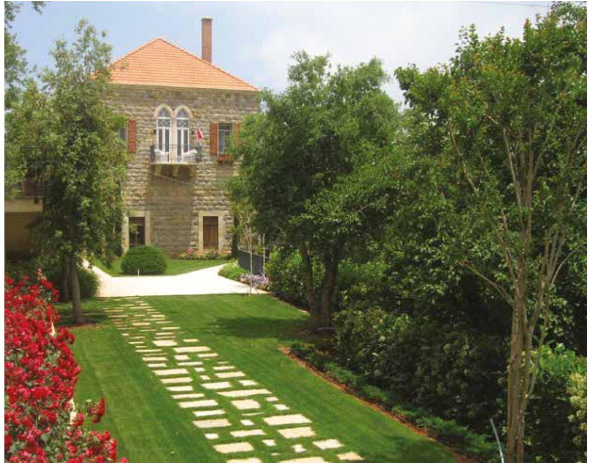
Private Residence - Dhour El Choueir, Lebanon

Exotica was founded in 1978 and has emerged as the specialist landscape contractor in the region with a proven track record of projects across the MENA region.