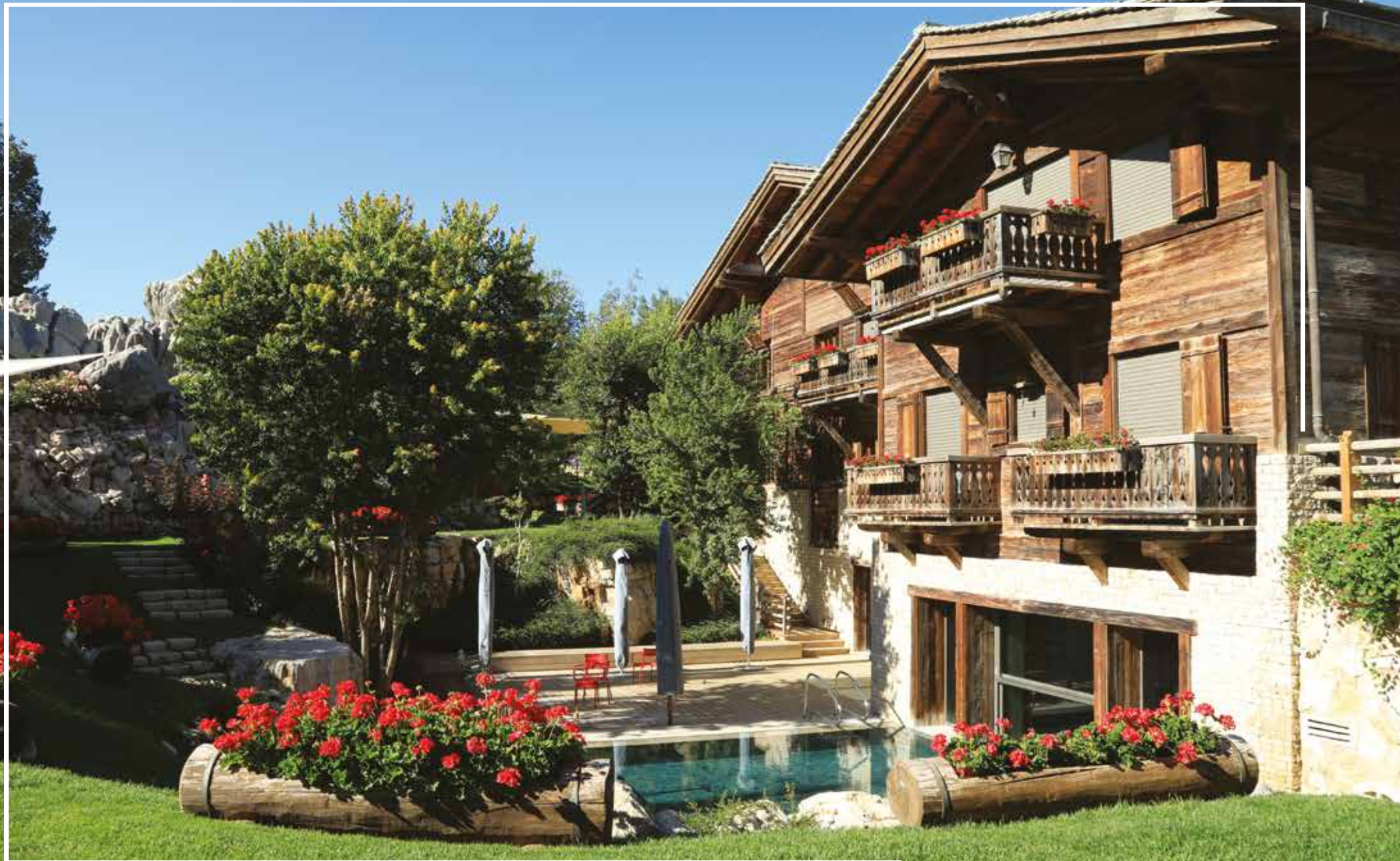
Private Residence - Faqra, Lebanon