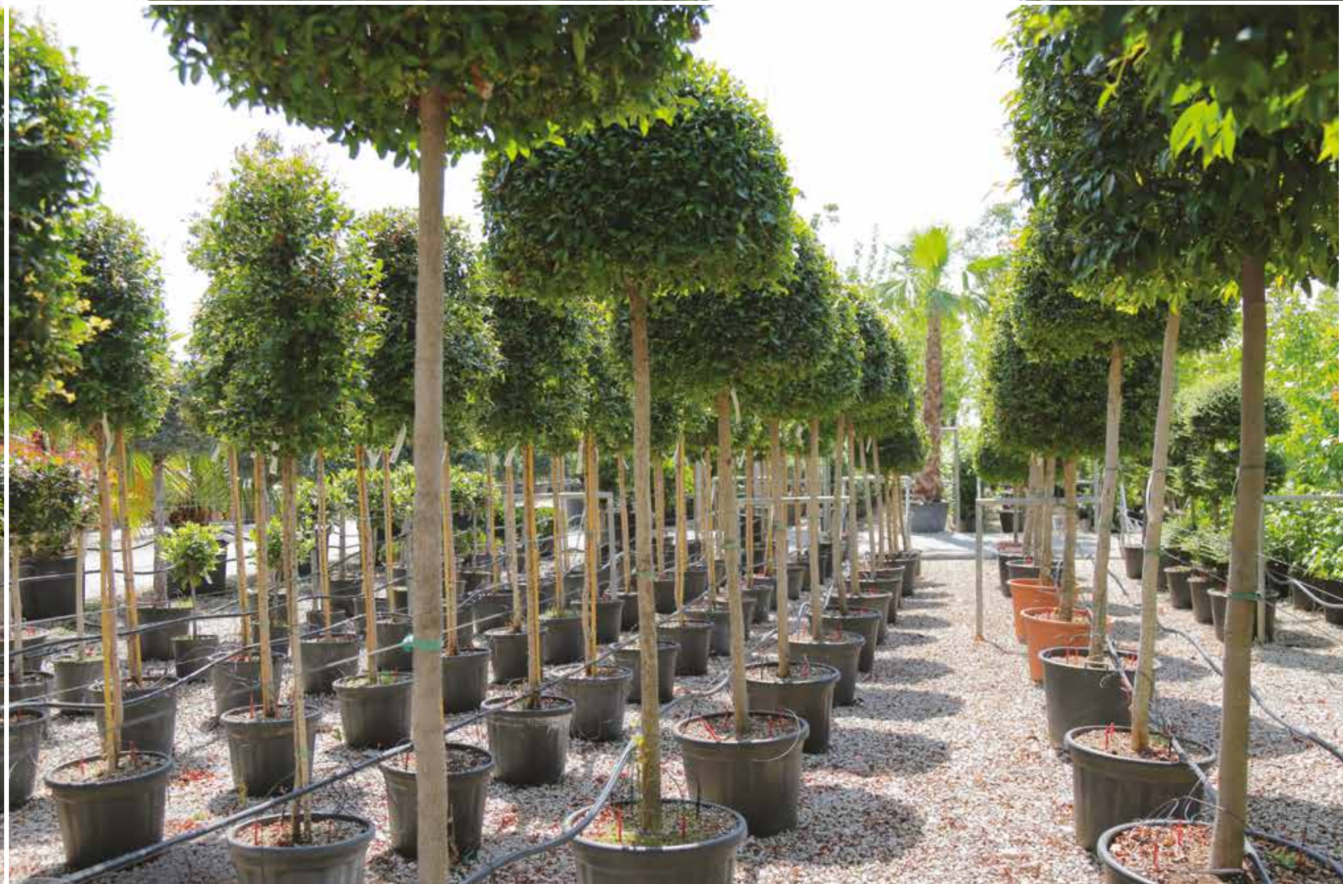
Exotica Nursery - Zouk Mosbeh, Lebanon