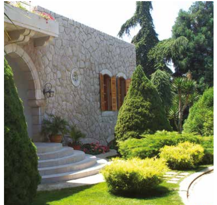
Private Residence - Aley, Lebanon

Most importantly, our experts create spaces that are tailor-made, breathtaking and sustainable.