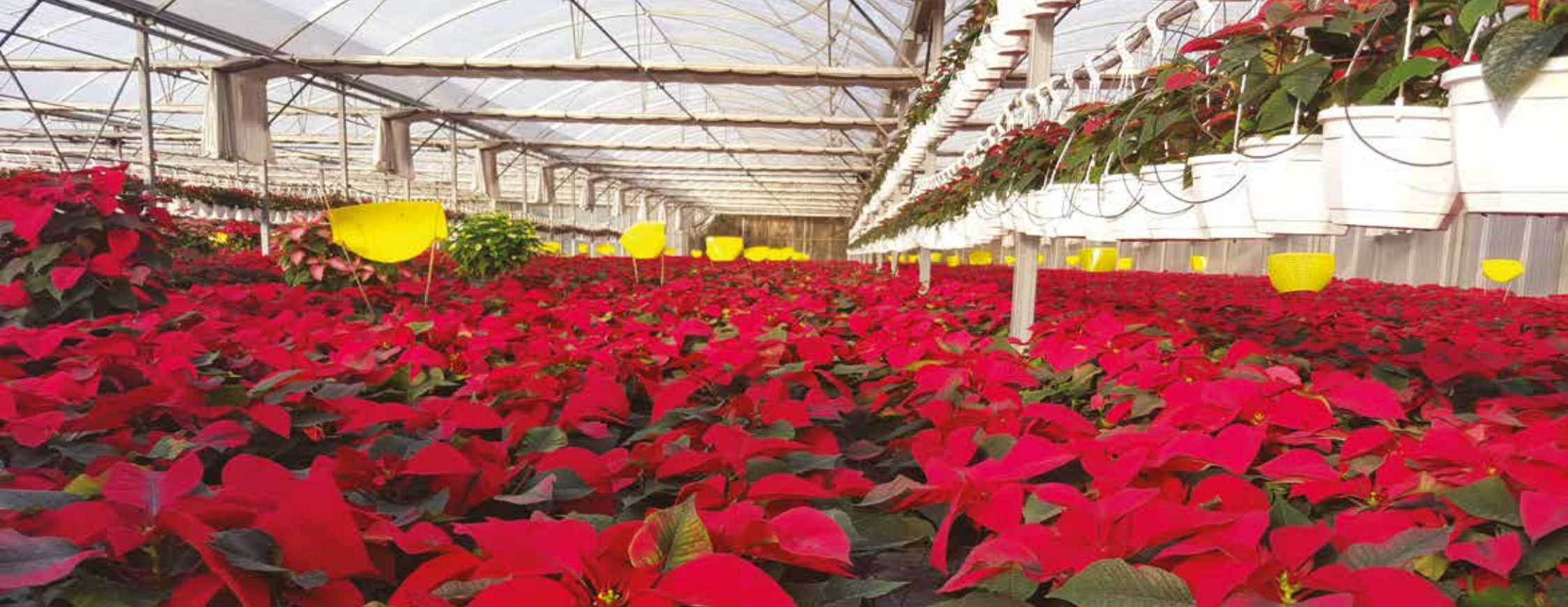
Exotica Indoor Plants' Greenhouse - Zouk Mosbeh, Lebanon