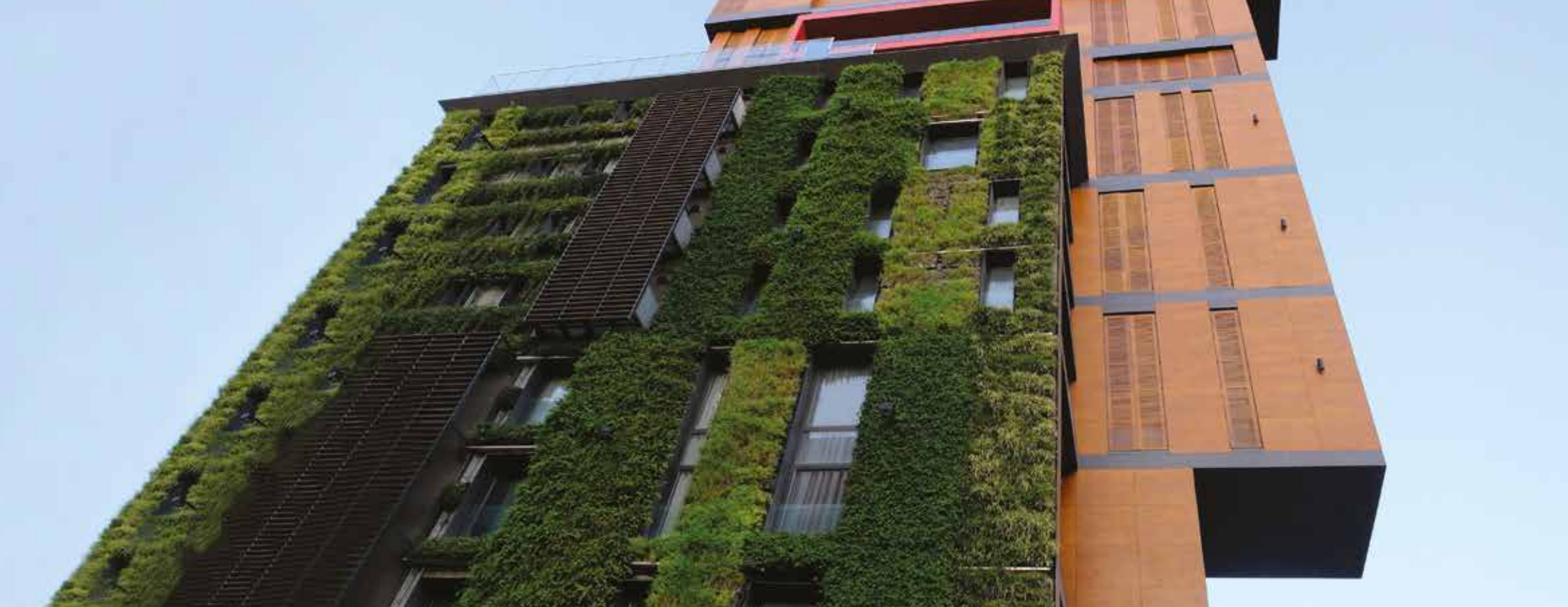
East Village Building - Mar Mikhael, Lebanon