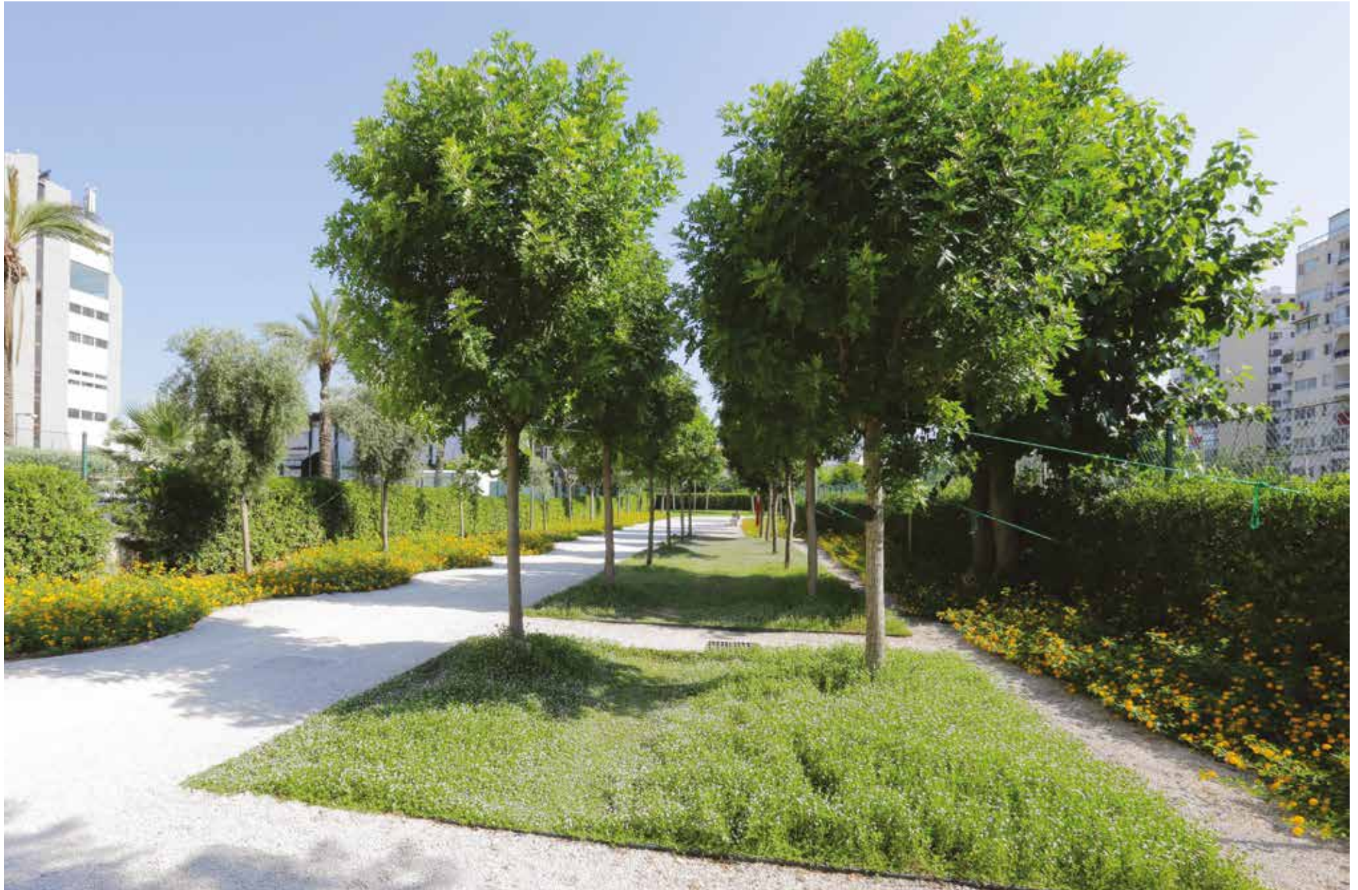
Jounieh Zone Verte - Jounieh, Lebanon