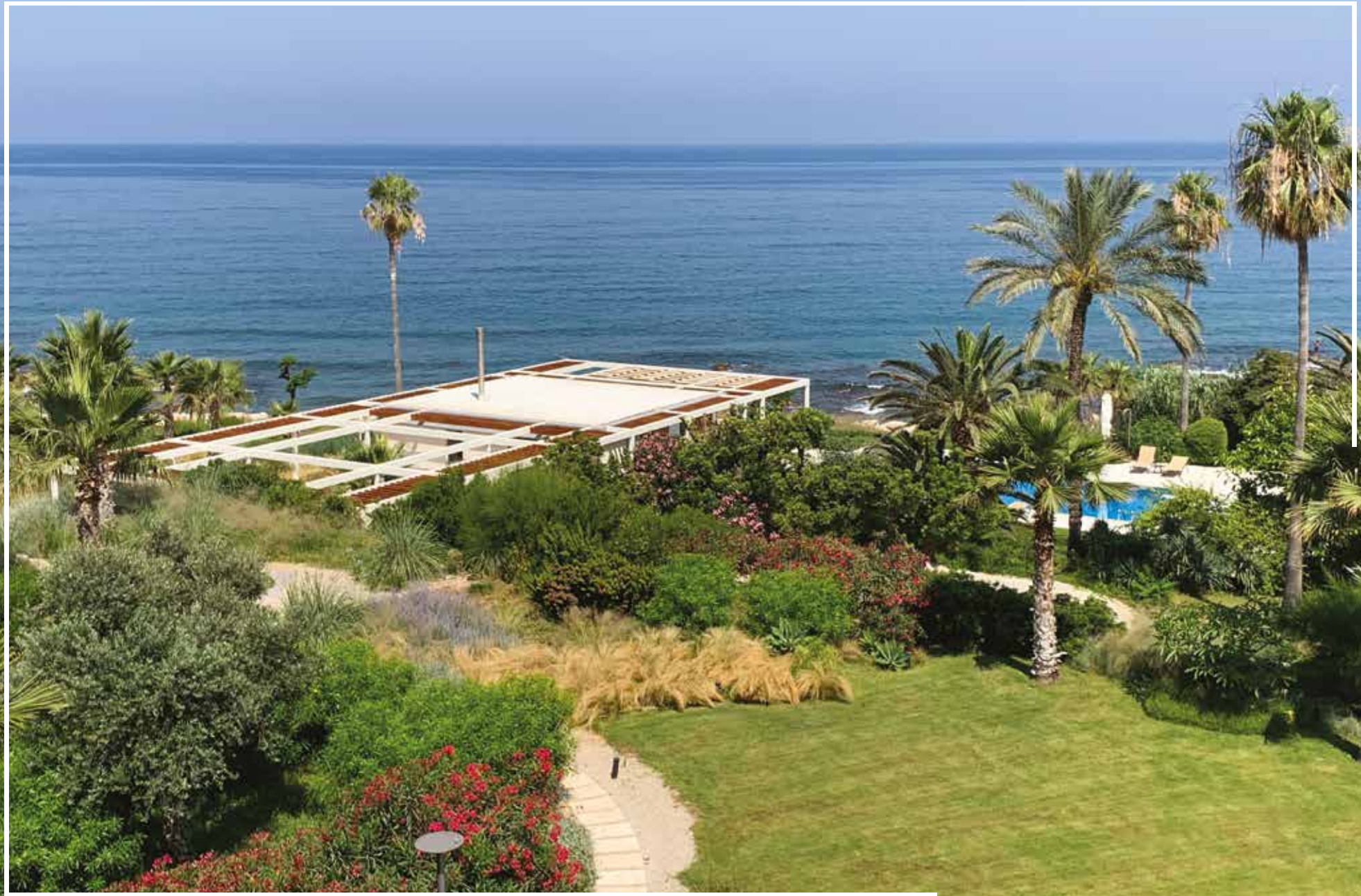
Private Residence - Amchit, Lebanon