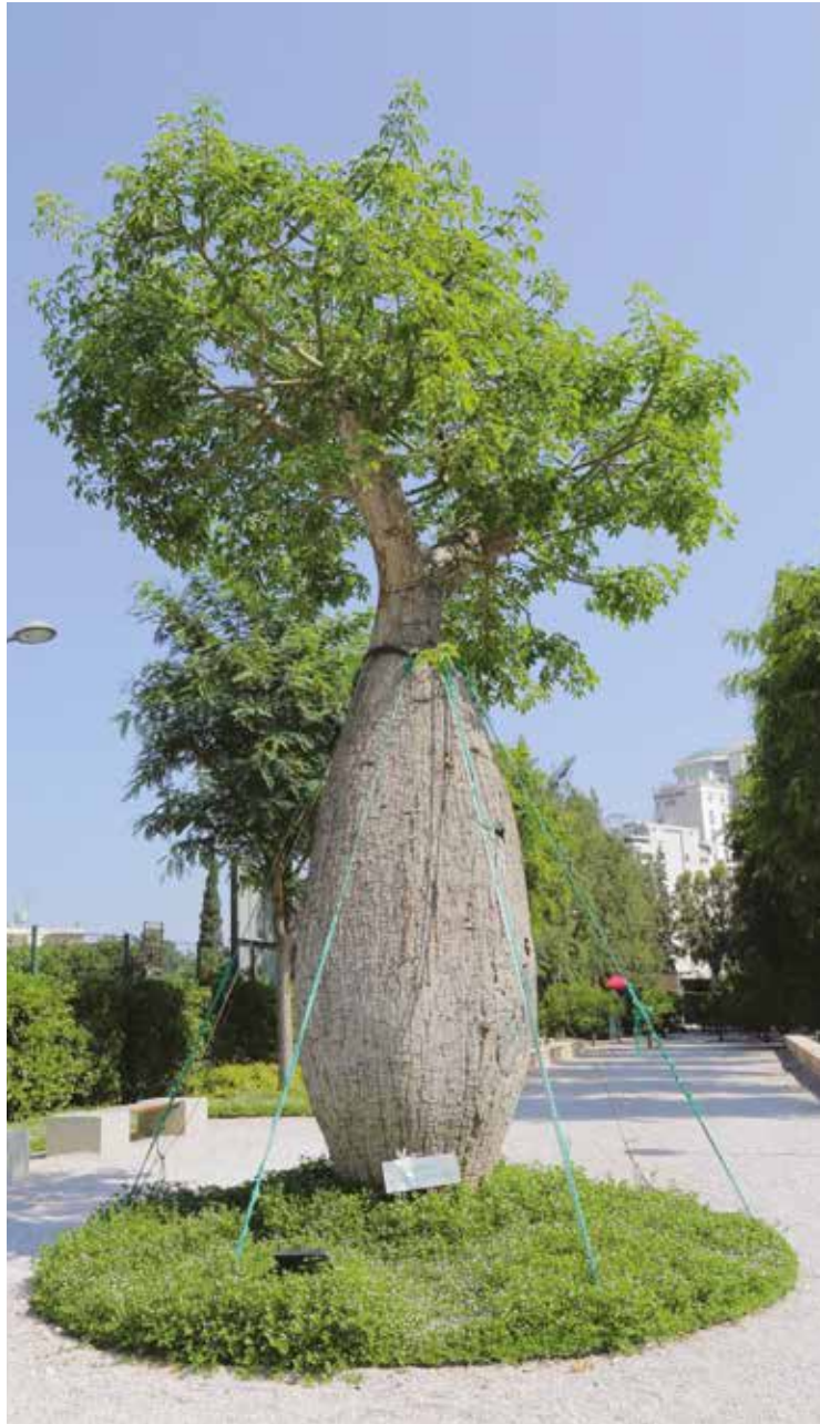
Jounieh Zone Verte - Jounieh, Lebanon